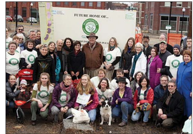
The future site of the MCM Co-op Railroad Square, Keene, NH

Where will the MCM Co-op be located? In downtown Keene! We are building a brand new 12,000 sq. ft. store in the Railroad Square site.